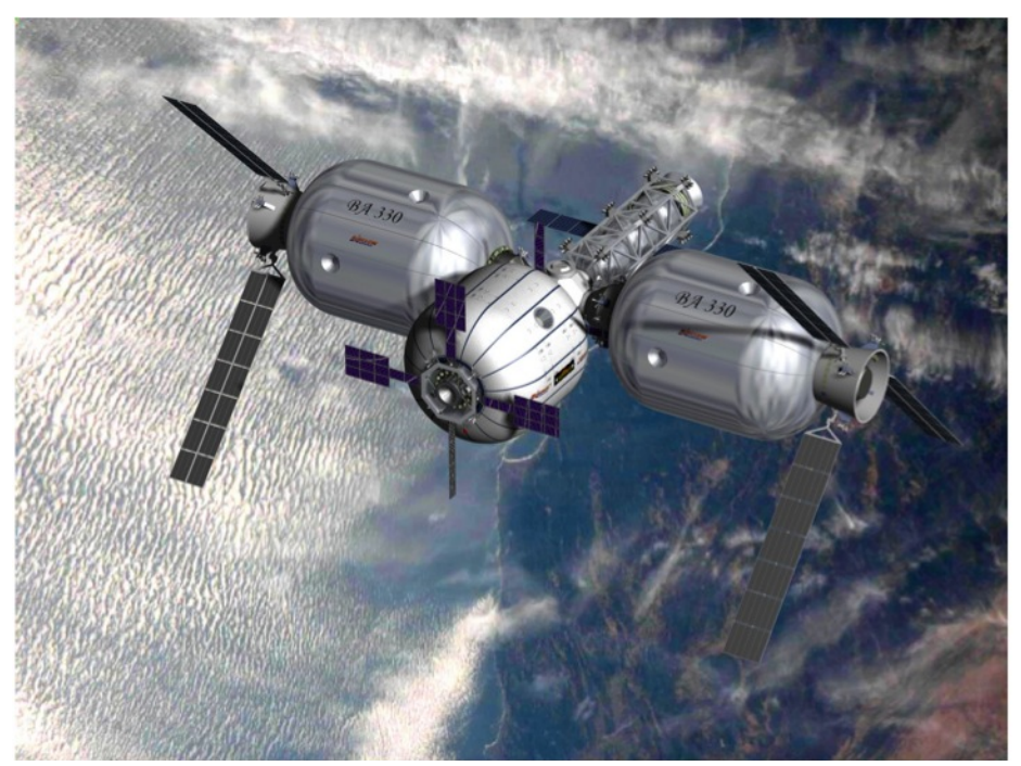
Figure 6: Private Space Station That Could Benefit From a 3D Printer

Developing the technology for in-space additive manufacturing and robotic assembly will enable the emergence of entirely new inspace markets for commercial and government entities, as well as providing the backbone to support NASA's human exploration visions. Examples of in-space market applications of 3D printing include: